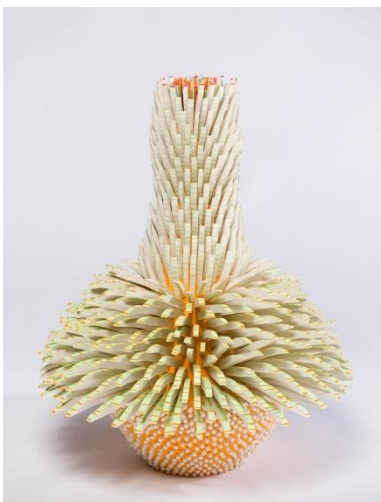
Zemer Peled (Israeli, born 1983), Untitled 1, 2016. Ceramic, 22 x 19 x 19 in. Crocker Art Museum purchase

From raw textures to meticulous details, to glazes bursting with color, the works in Cool Clay represent one of the most exciting and expansive fields of contemporary art.