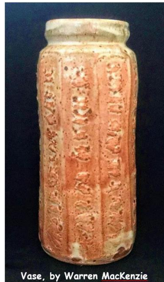
Vase, by Warren MacKenzie