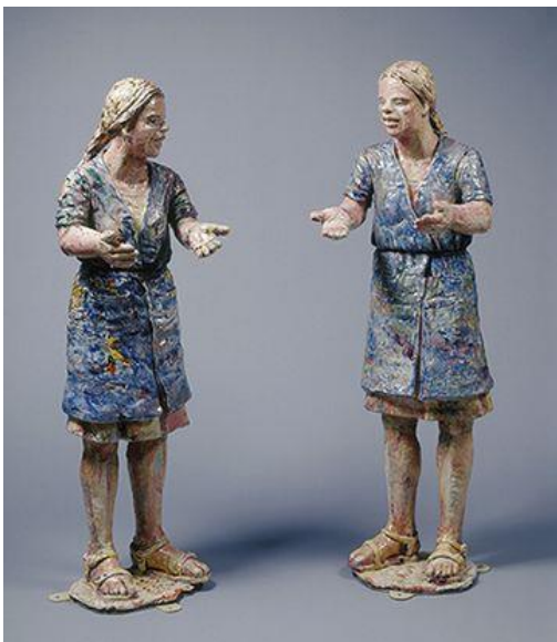
Image: Viola Frey, Double Self , 1978, ceramic and glazes, 64 x 20 x 18 1/2 inches

2019 marks the 15th anniversary of Viola Frey's passing, so it's the perfect time to mount an exhibition honoring her stature in the Bay Area art community and beyond. She is best known for her monumental sculptures, but "Viola Frey: Her Self" will present viewers with a more intimate, down-to-earth point of view. The exhibit will focus on Frey's self-portraits in multiple mediums, from drawings to oil paintings to ceramics, and includes work that spans over four decades of her career. The artwork on display has personal significance to the artist, and even when life-sized (Ms. Frey was less than 5 feet tall), visitors will be able to look her in the eye.