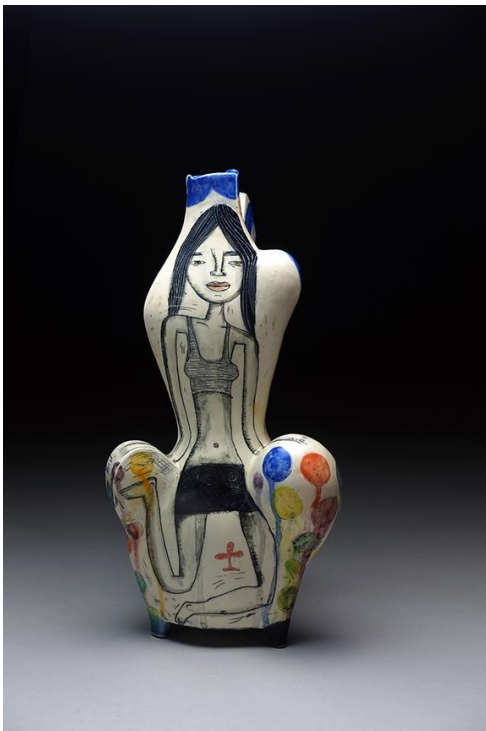
Kevin Snipes, Three Girls, 2015