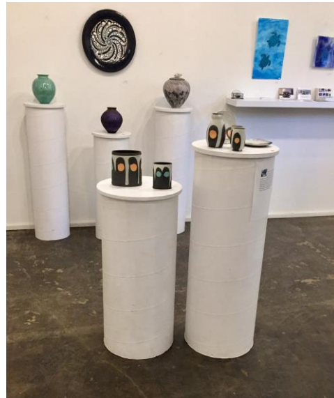
A snapshot of our show at the E Street Gallery.

(Application also sent out with Newsletter)